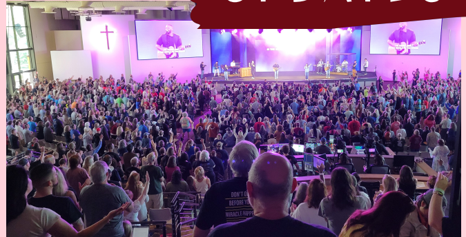
▲ Worship at CR